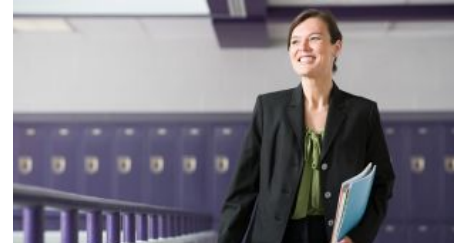
20 SF jobs that pay $100K

Driver of SFFD rig that struck crash survivor had been warned to avoid girl lying on ground.