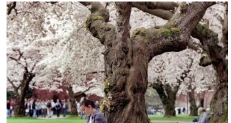
20 best value colleges in U.S.

You'll be surprised by some of these careers that can land you a six-figure salary. Take a look.