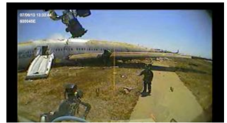
Rig alerted to Asiana victim