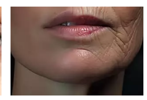
Expert Says This Drugstore Winkle Cream Is Actually Worth It