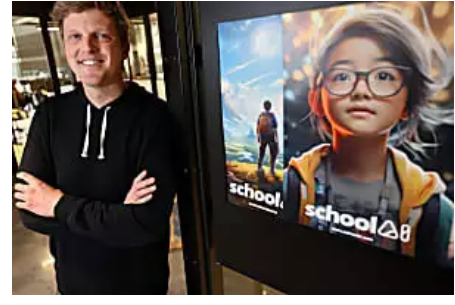
How some educators are harnessing the power of artificial intelligence