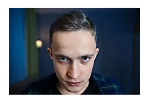
Signs of Schizophrenia -Take a Look at Them (Some May Surprise...