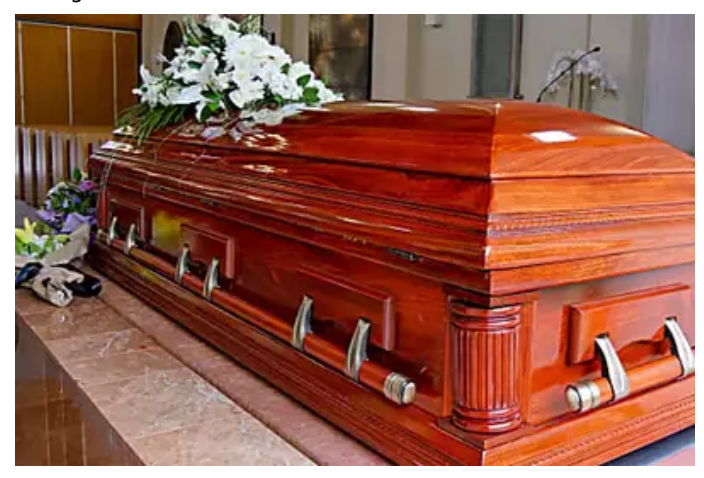
Here Is The Cost To Be Cremated In 2024 (See Prices)