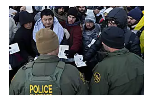
Sen. Mitt Romney on the border bill: Politics is now 'the art of the...