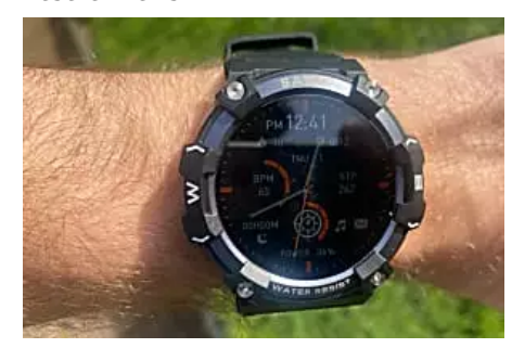
Invincible US Military Smartwatch Finally on Sale In United States....